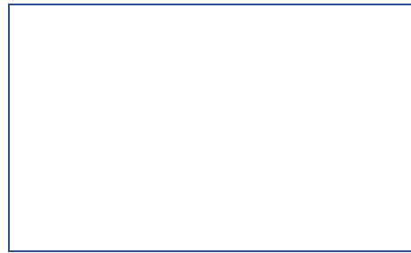
Figure 2 The Figure is centered and no more than 2 figures

Lorem ipsum dolor sit amet, consectetur adipiscing elit. Nulla vitae purus vel ante blandit euismod. Curabitur vitae lacinia tellus. Sed ipsum lectus, porttitor sit amet risus sed, hendrerit dapibus leo. Vestibulum condimentum volutpat nisi sit amet suscipit. Maecenas id nunc eu enim hendrerit vestibulum. Pellentesque sed ex ipsum. Vivamus